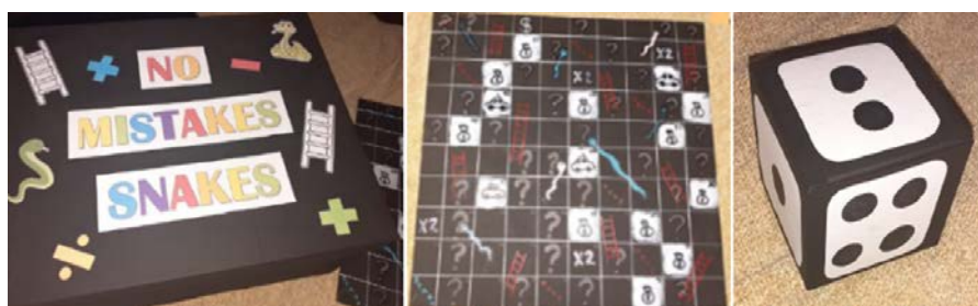
Figure 1: An example of a mathematics board game (Group 5).

The researcher randomly selected 20 students to complete individual task-based questions on a Google Form. Students had to reflect on the nature of their collaboration in terms of the support from their group members, their responsibility, personal interaction and communication, the challenges that they experienced and how they managed it. Moreover, they had to award a mark out of 10 for themselves, as well as for each of the group members regarding their active participation and contribution to the group. Unfortunately, only 12 students completed these questions because the semester ended. An example of a mathematics board game is shown in Figure 1 below. The figure displays the components of the board game of Group 5, which they named No Mistakes Snakes. The objectives with their game were that learners should recognise patterns, describe general rules or relationships of patterns, and calculate the input and output values of a given pattern.